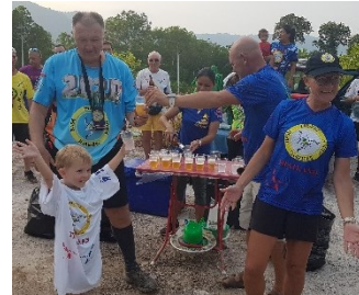
25 Run shirts for Wise Man – how chuffed was he?!