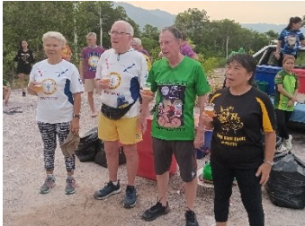
Welcome back Hashers. The couple on the right did PH3 run #3!