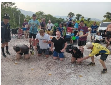
A nice hot day for getting iced. Welcome Virgins.