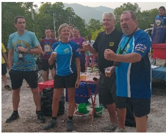
Happy St. Patrick's Day to Repressed One and the 'Plastic Paddies'.