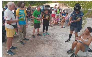
Hello to our Visiting Hashers.