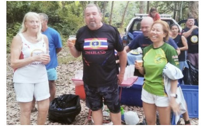
Jaws (700 runs)