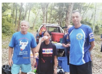
Dirty Dozen (400 runs)