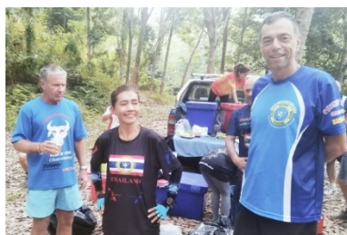
Tequila Slapper (444 runs)