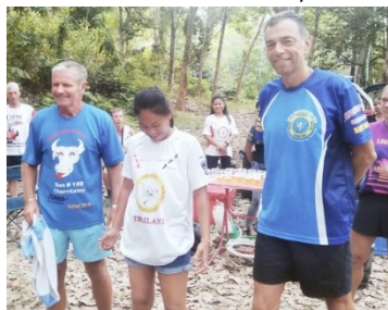
Long Time (100 runs)