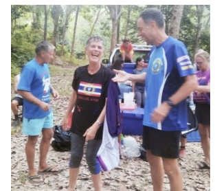
Soi Dog (222 runs)