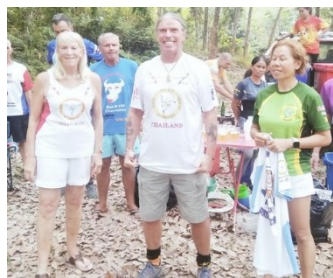
Any Time (100 runs)