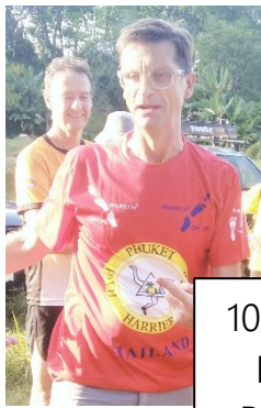
10 Hares – Philthy Pisshead