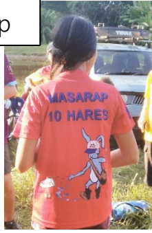
10 Hares – Masarap