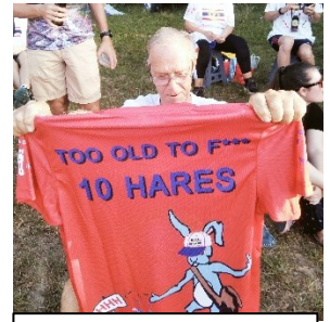
10 Hares – Too Old To Fuck