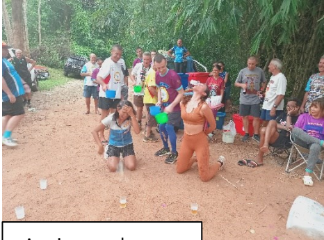
An icy welcome for the Virgins!