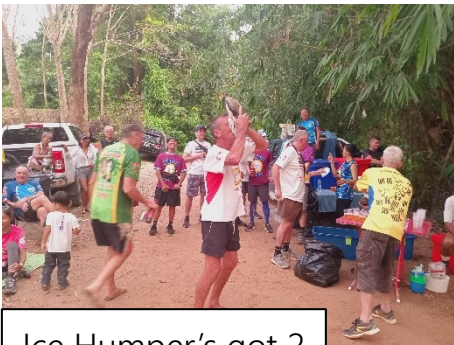
Ice Humper's got 2 new shoes!