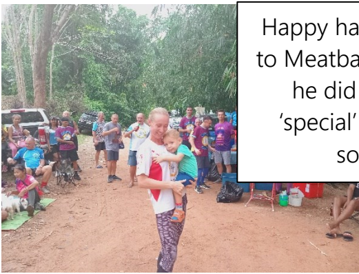
Happy hatching day to Meatballs, and yes he did get the 'special' birthday song.

Lucky Lek gave his unique cry of, "Announmen":