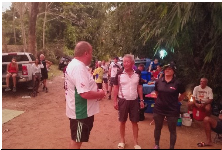
Fix Her Up and Spare Parts are new members of the Hash (6 runs done)