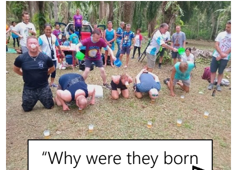
"Why were they born so beautiful..?" 🎵