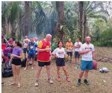
It took a long time to round up the visiting hashers this week... There was a bit of confusion about some gatecrashing youths who had turned up but hadn't registered!