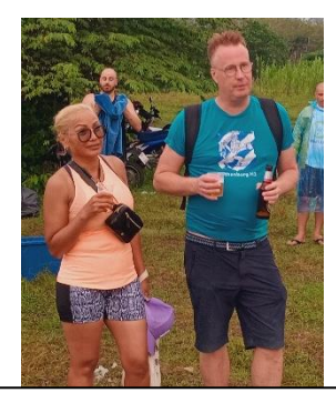
Hello fellow Hashers from Gothenburg.