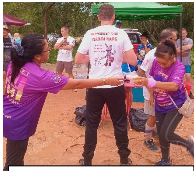
Virgin Hare shirt for Repressed One