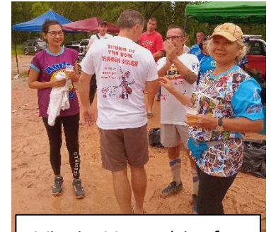
Virgin Hare shirt for Thumb In The Bum