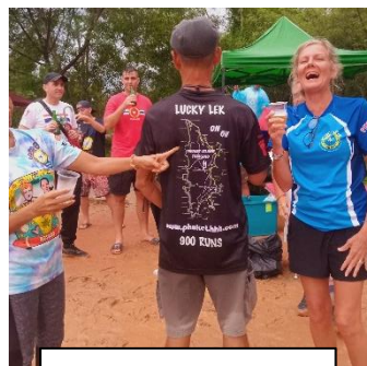
900 Runs for Lucky Lek