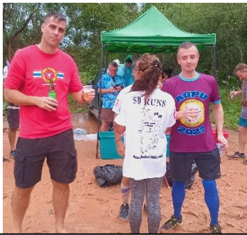
50 Runs for Goody Goody Moron