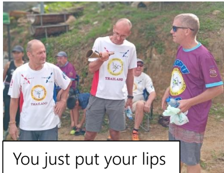
You just put your lips together and blow...

The Hares kindly told us that hazards would be marked with stripy tape. But they didn't tell us to watch out for ATVs flying up the track! The walkers and runners set out together but not before