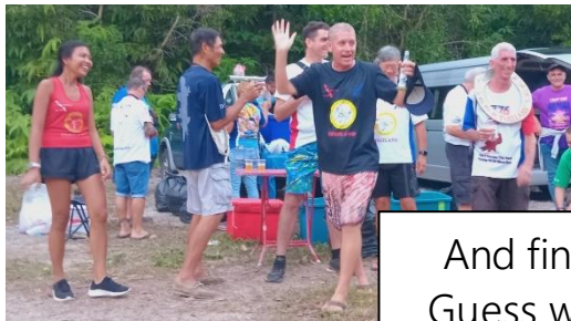
And finally... Guess what..? Hash Shit!