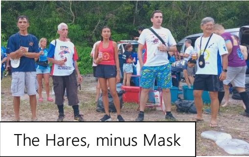
The Hares, minus Mask

The Laager site was in the old quarry area off Chaofa City Road. It was up a wrecked mud track, only accessible by intrepid 4x4 drivers. Despite this, it was a pleasant enough spot but the ice block was more of an ice pancake. The Run Master picked Achmed The Saviour to be Hash