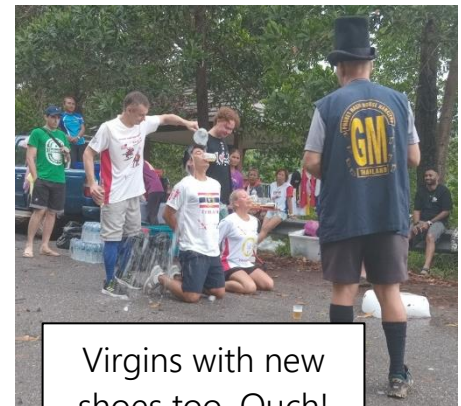
Virgins with new shoes too. Ouch!