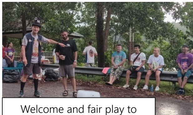
Welcome and fair play to Mother May I, Visiting Hasher, who ran in sandals!