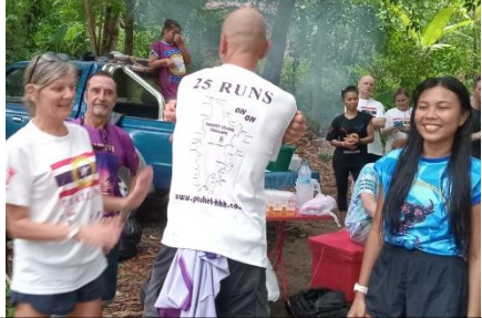
'25 Run' shirts this week went to Agonorhea, Brown Sugar and Polish My Crabs, respectively.