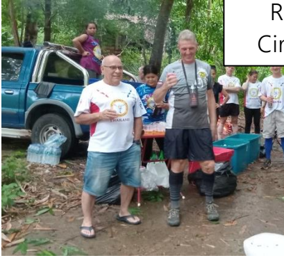
Returners, Short Circuit and Wilma.