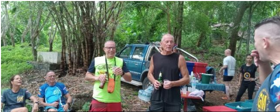
F**k off you c*****s ... and don't come baaack! 🎵

Manneken Pis – called in by Substandard, for wearing his t-shirt tucked in, Rick Astley style.