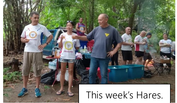
This week's Hares.

The Laager site was beside a rubber tree plantation at the end of Soi Naya, Rawai. It had a healthy selection of mosquitoes and ants, plus a welcoming camp fire and a live electricity cable on the ground!