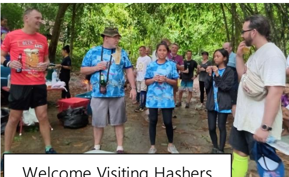
Welcome Visiting Hashers

Unfortunately, The Invisible Man took a tumble and was whisked away to hospital to have his knees checked out. Butt Plug took over as this week's GM, after only 2 weeks of retirement!