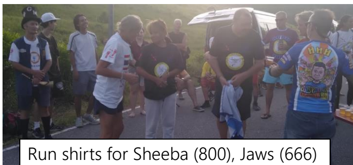
Run shirts for Sheeba (800), Jaws (666) and Takes It All In (25).

Hashit didn't go to the Hares this week but to Tootsie; the lone voice shouting 'Hashit'!