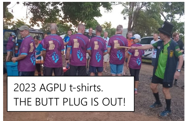
2023 AGPU t-shirts. THE BUTT PLUG IS OUT!