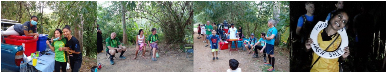
The Beer Bitches

Run Offenses were interrupted by Gorgeous coming in to scream at Invisible Man for touching Dirty Dozen after calling her into the circle to wish her Happy Birthday. IM was properly iced. Later, IM was seen touching someone else and the vicious circle chanted for ice—and he was iced again. Gorgeous, being senior and selectively senile then came into the circle to hug the young woman who'd been iced earlier. Wiley Old Fox that man is. Invisible Man is learning. Jaws and a visitor were brought in. Apparently the visitor was heard pondering out loud just how big Jaws might be if he didn't exercise. Looked at another way Jaws provides shade in sunny laagers.