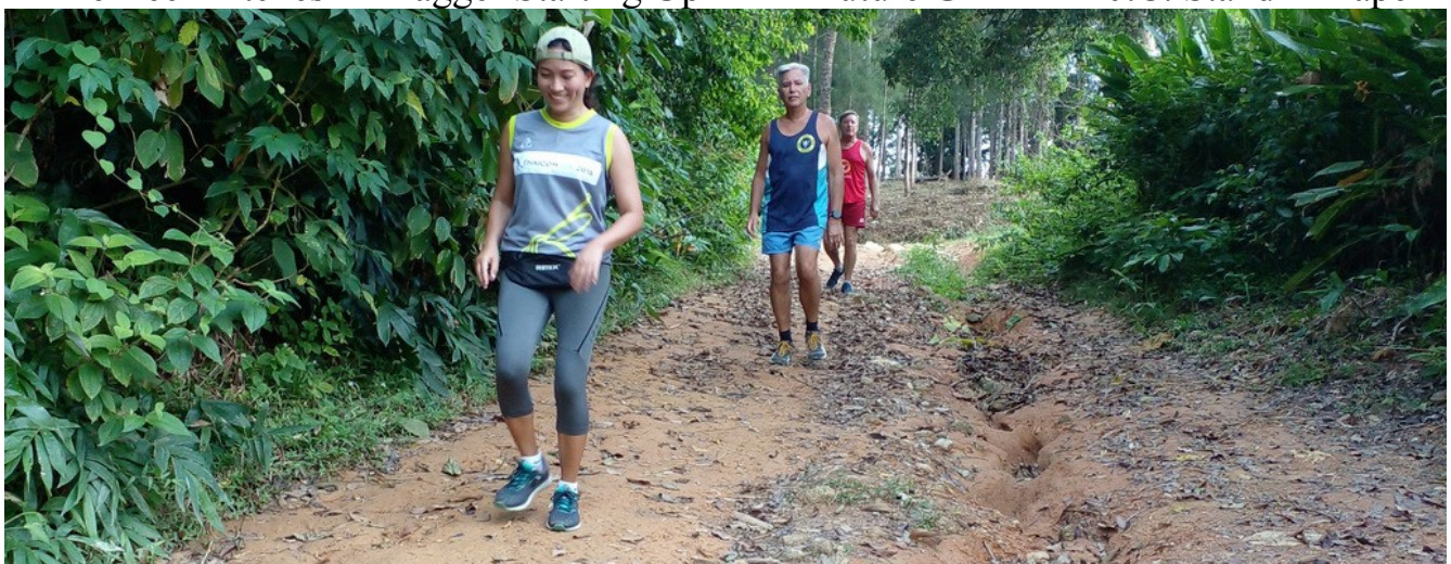
Walkers On The Run