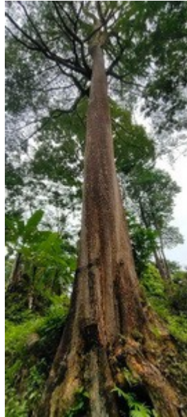
Incredible, Huge, Tall Trees Today