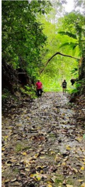
Dangerous & Beautiful you ask?

The GM's circle opened with getting Wilma on the ice for having told NLE to turn right, then turning left and sprinting in. New rules put anyone coming in before the GM on the ice. GM then got the hares in for not ensuring the sprinters heading out didn't overshoot the out-trail turn and find the in trail of the lollipop . But, if it can go wrong, it will. Hangover lead a small group in the wrong direction until they finally met the correct direction runners just at a juncture where Fungus had laid a deadly beautiful fun check. Some were coming and others were going. Later in the circle Invisible Man cried he and several others actually did the bad-ass check twice. Well done hares, down-down!!