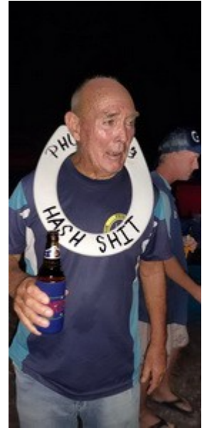
Still as sharp as a Tack!

The all-night heavy rains backed off in time for great running weather, and some nice muddy puddles and sloppy spots. The hares defended claiming even more value-added, and besides, those trapper's snares were small.