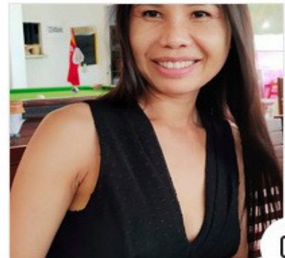
PH3 Action Team